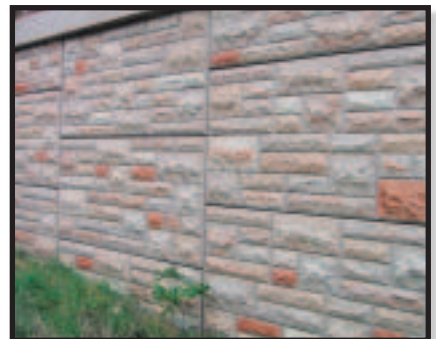
Ashlar Stone – Multi Colored Stain