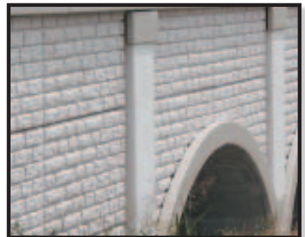
Chiseled Limestone + Optional Pilasters