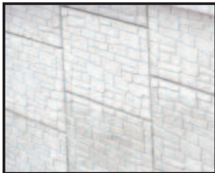
San Diego Drystack